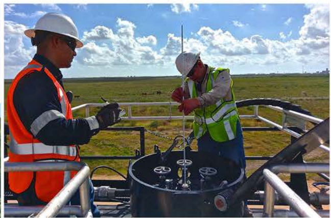
Fall protection cages, safety platforms, gangways.