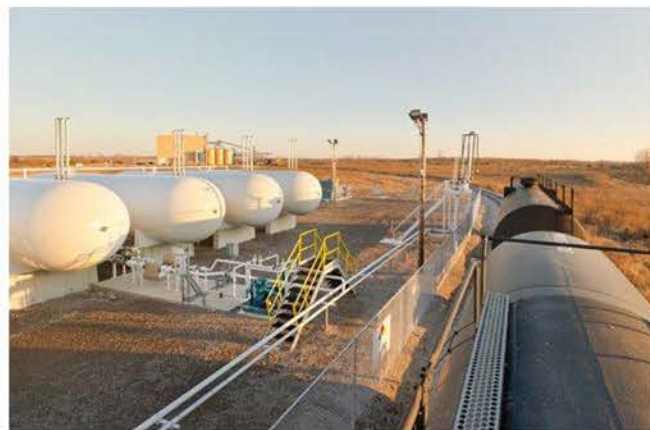
From single- to multi-car rail unloading operations

In addition to our mobile and portable transloading solutions, TransTech offers large scale, permanent rail tower installations and storage & distribution terminal design, engineering and construction services to support all your liquid transfer needs.