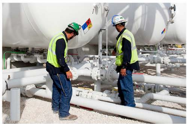
Start-up & commissioning, training and maintenance services.